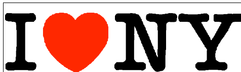
Figure 3: The famous "I Love New York" tourism logo (image adapted from The Official New York State Tourism Website, http://www.iloveny.com/ ).

In my many visits to Ecuador, I often have heard Ecuadorians refer to the United States, and to New York City in